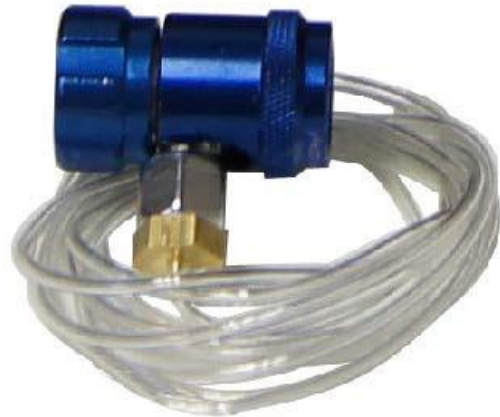
Coupler with Filter